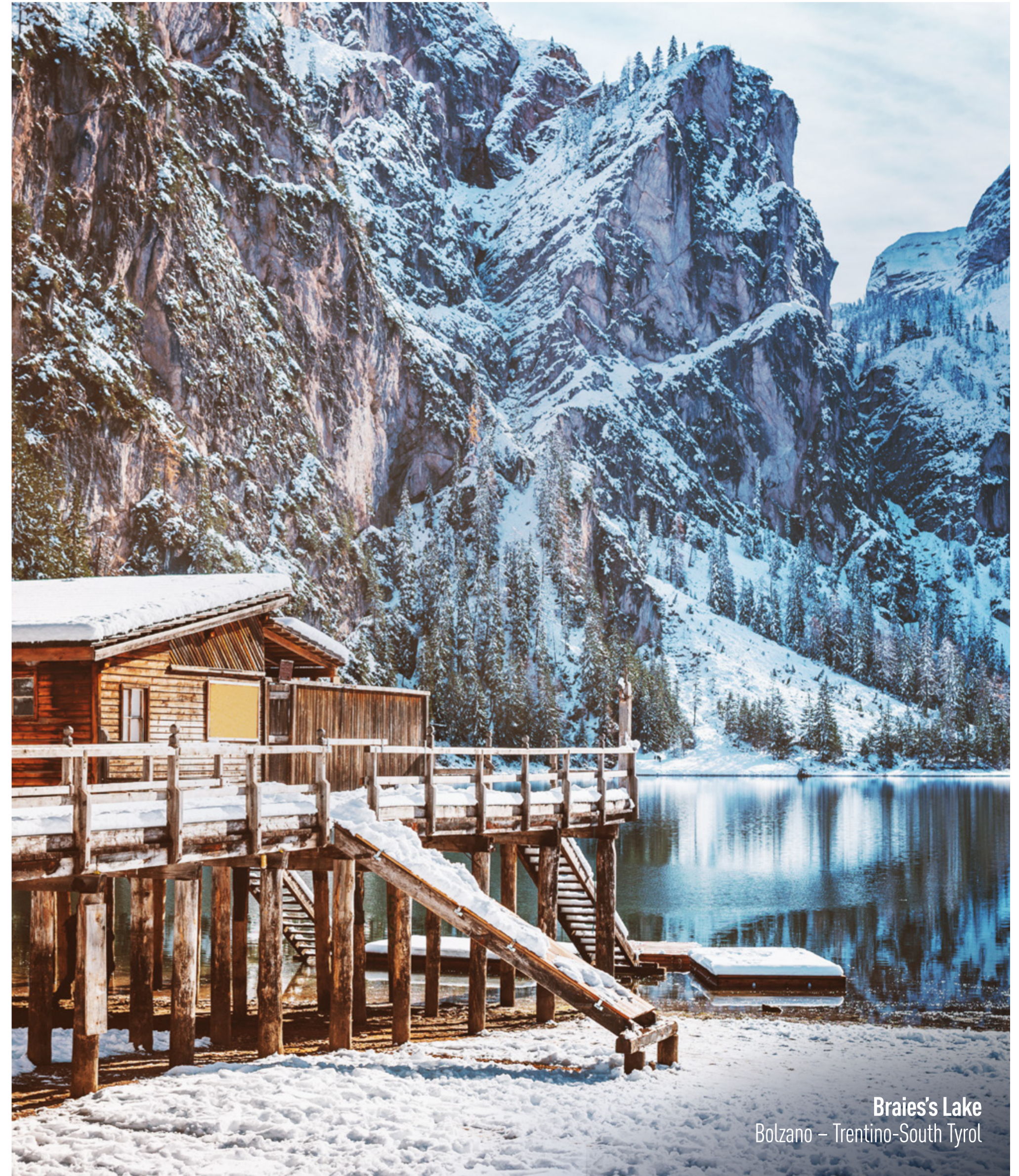
Braies's Lake Bolzano – Trentino-South Tyrol