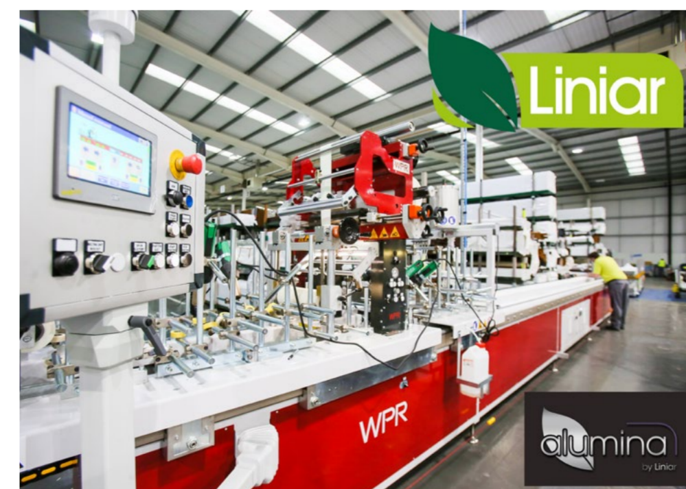
NWS.350.12000 IN LINIAR'S PRODUCTION PREMISES